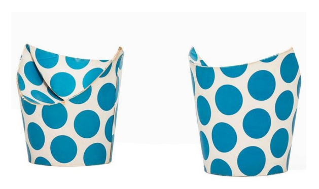
This pair of chairs were up for sale at a cost of £1736 per item. A bit more than the original £1 they may have cost!