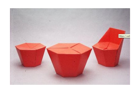
Other examples of Murdoch's paper furniture range.