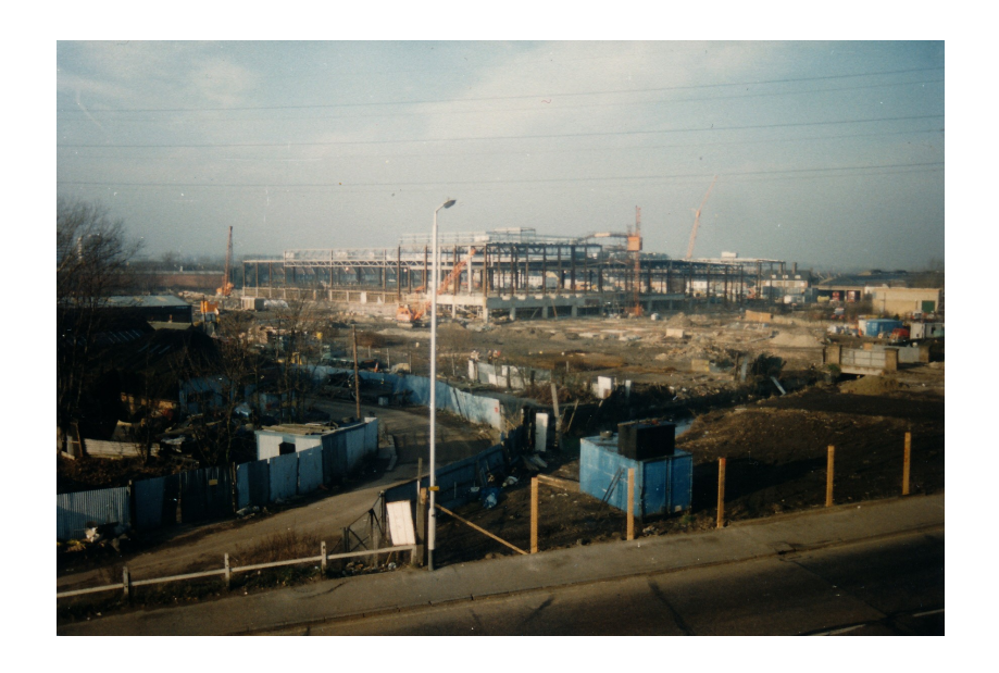
Savacentre under Construction Eric took this photo prior to the opening of Merantun Way in 1986, so in 1984 or 1985.

View looking west The ornamental dome atop the tower of the Tandem main office block is centre right. Merton Abbey Mills can be seen in the background along with Runnymede (left). As the Savacentre and Merantun Way are open, Eric probably took this photo in 1987 or 1988. The open area in the centre of the pictrure has now been built on.